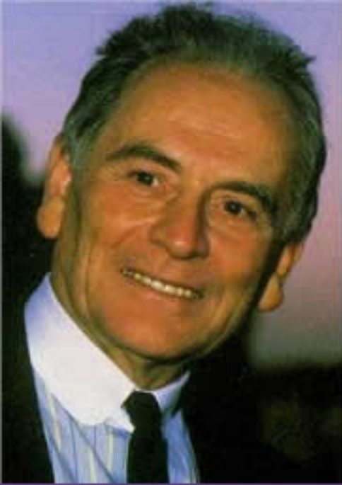
Pierre Cardin, nato Pietro Costante Cardin (1922)